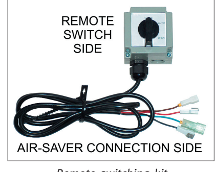
Remote switching kit